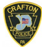
Mayor James G Bloom

Crafton Borough Police Department Crime Prevention Unit 100 Stotz Avenue, Pittsburgh, PA 15205 Emergency Call 911 Police Administrative Office (412)921-2016